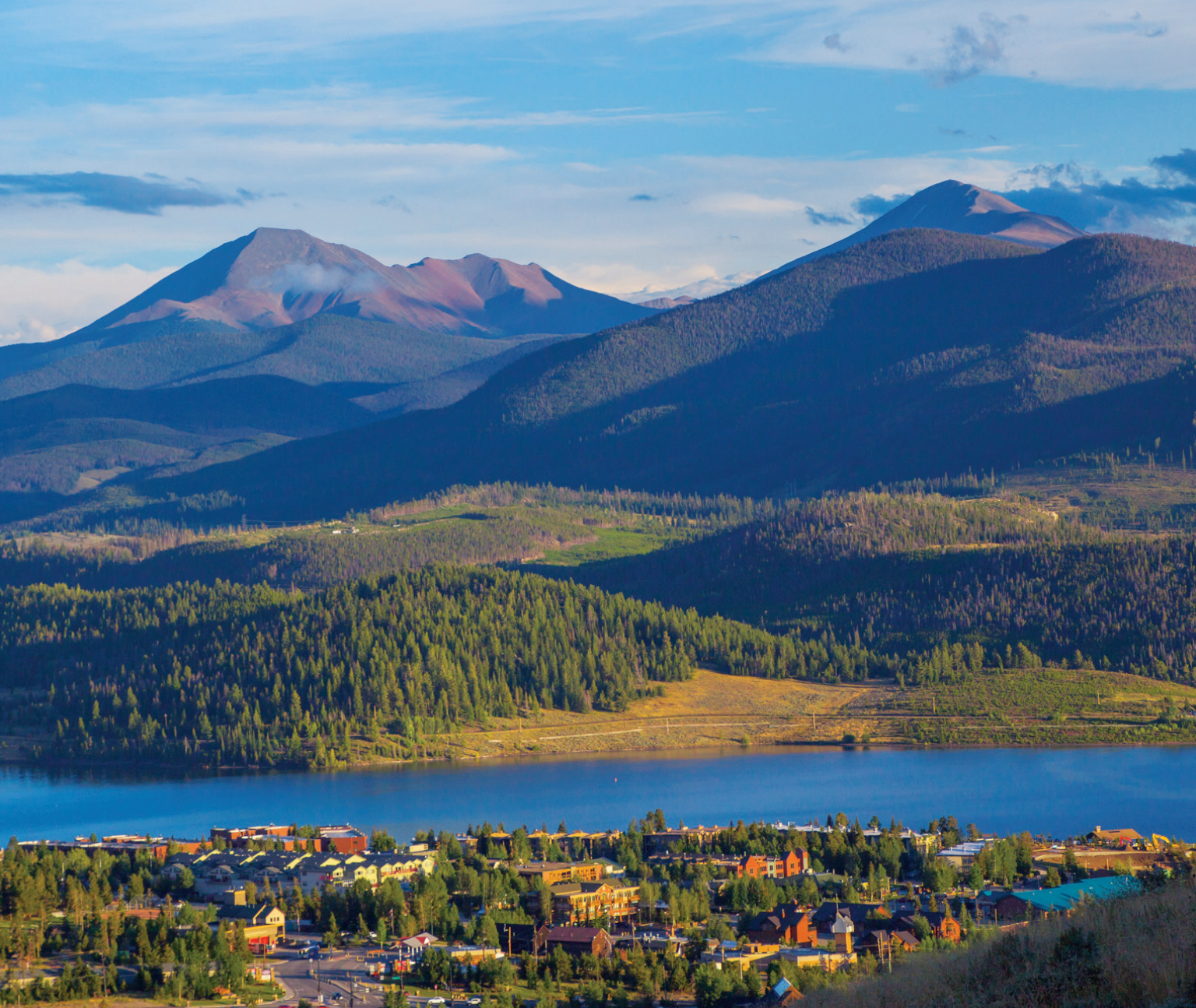
CLOCKWISE FROM TOP LEFT: DILLON FARMERS MARKET; LAKE DILLON; ICE SKATING; KAVAKING; LAKE DILLON THEATRE COMPANY; FISHING.

Inspired by the nationwide movement, Silverthorne has made the first Friday of every month a reason to get together, with events showcasing local artisans and interactive experiences at various locations throughout town. Art, food, music and other entertainment make it the perfect opportunity to hang with the locals.